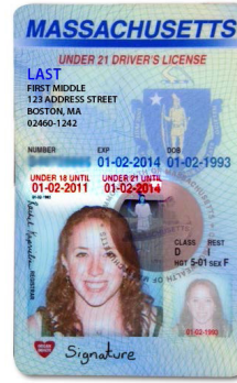
MA Under 21 License no longer being issued as of July 2016; will be in circulation until July 2021.