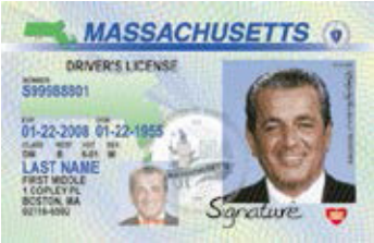
MA License no longer being issued as of July 2016; will be in circulation until June 2021.