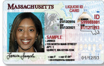
New Liquor ID as of July 2016.