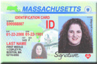
MA Liquor ID no longer being issued as of July 2016; will be in circulation until June 2021.