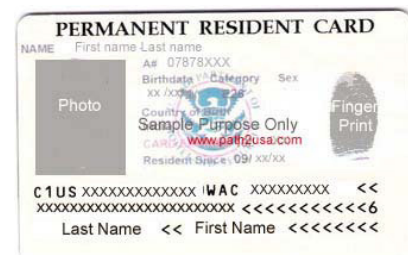
US Immigration Card

For more information, contact your local Board of Health.