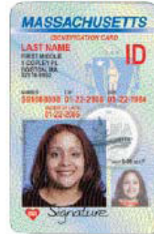
MA Under 21 ID no longer being issued as of July 2016; will be in circulation until June 2021.