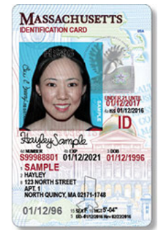
New MA Under 21 ID as of July 2016.